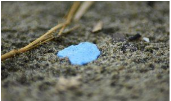
"Micro Ocean Plastic," by OceanBlueProject.org is licensed under CC BY-SA 4.0.

Though plastic is durable, cheap, and common in everyday items, it comes at a large environmental cost.