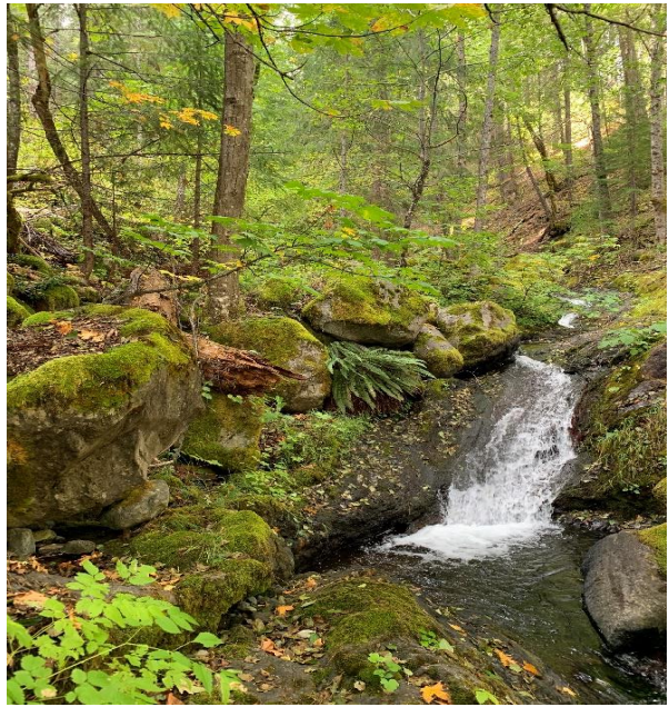
Unnamed tributary to Boulder Creek, Klamath National Forest.

On October 8, 2015, the North Coast Regional Water Board adopted the Waiver of Waste Discharge Requirements for Nonpoint Source Discharges Related to Certain Federal Land Management Activities on National Forest System Lands in the North Coast Region , Order No. R1-2015-0021 (2015 Federal Waiver).