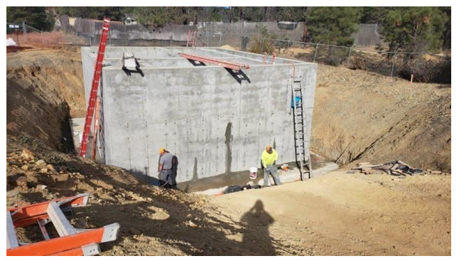
The construction of the Aeromod activated sludge process unit. The Aeromod treatment unit has had all the forms removed and is currently being water tested.

Construction began this year, and is currently under way, with active progress being made this summer and continuing to date as a result of favorable weather into the winter period.