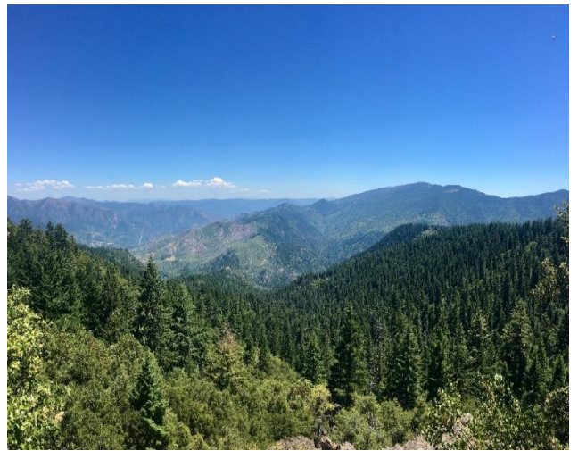
Panoramic view of southwestern Six Rivers National Forest oriented east.

Regional Water Board staff have determined these significant modifications warrant a new CEQA document, such as an Environmental Impact Report, to accompany the Federal Order. Development of both the Federal Order and the accompanying CEQA document will exceed the time available to revise the 2015 Federal Waiver before it expires in October 2020. Accordingly, Regional Water Board staff will propose a short-term renewal of the 2015 Federal Waiver for the Regional Water Board's consideration in the summer of 2020. Staff currently anticipate the Federal Order and CEQA document will be ready for public review and consideration by the Regional Water Board in late 2021 or 2022.